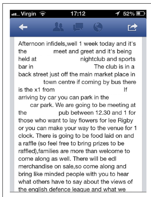
Figure 3. Facebook Post by EDL Divisional Leader 2013.

hometown's EDL demonstration, the woman had called her a Nazi 'and crossed me off her Christmas card list'. Another member explained that he knew many people in his local area from 'working the doors' (i.e. as a bouncer), yet those same people now 'close their curtains or hide in a doorway' to avoid him.