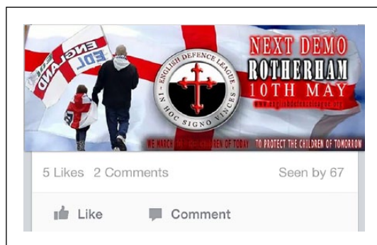
Figure 2. Official EDL Promotional Material for Demonstration in Rotherham on 10 May 2014. Caption: 'We march for the children of today to protect the children of tomorrow'.

baby girl. He paused and said, 'If they [the Islamists] have their way, that baby will be wearing a burqa', to which one audience member replied, 'No fucking way!'. At the Wolverhampton meet-and-greet, the divisional leader told the audience: